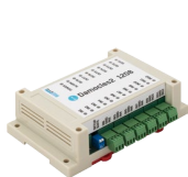
Damocles2 1208 12× DI, 8× DO OC, stand-alone device