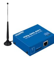
HWg-SMS-GW3 GSM gateway for ring and SMS notification