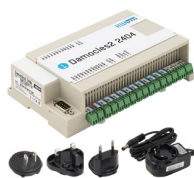
Damocles2 2404 set 24× DI, 4× DO relay, includes a power adapter