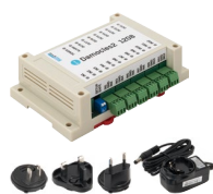
Damocles2 1208 set 12× DI, 8× DO OC, includes a power adapter