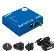
Damocles2 MINI set 4× DI, 2× DO relay, includes a power adapter