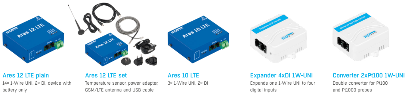
Ares 12 LTE plain

14x 1-Wire UNI, 2x DI, device with battery only