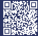
RUTX08 360° VIEW