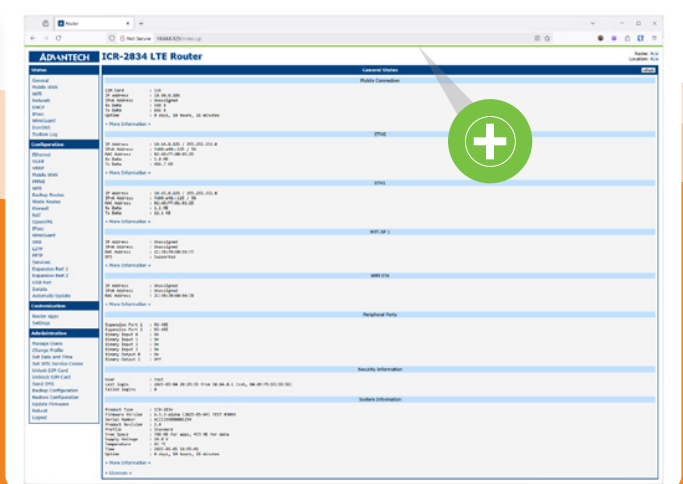
Web interface of routers with standard firmware (green line)